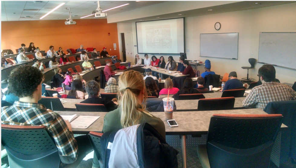
Workers Share their stories at Roosevelt University