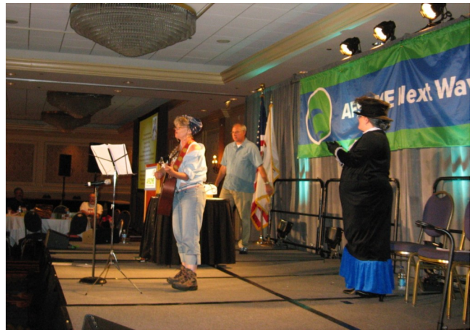
AFSCME Council 31 staff members play labor figures at the NEXT Wave Conference.