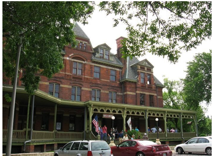
With its classic 19th Century verandah, the Florence Hotel becomes the welcoming heart of the Pullman neighborhood.