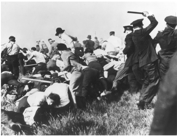
Testimony before the Senatorial Investigating Committee, July 1937

There were shots fired, and I saw people in front of me going down... It seemed as though they were going down, as though you would take a scythe... I looked to my right. I saw the officers on the right with their revolvers drawn, not shooting in the air, but pointing point blank into that crowd.