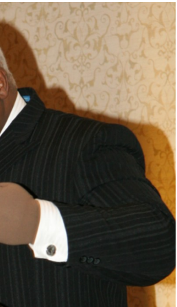
...ers two-fisted speech.