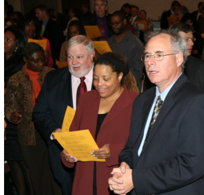
And they all sang!