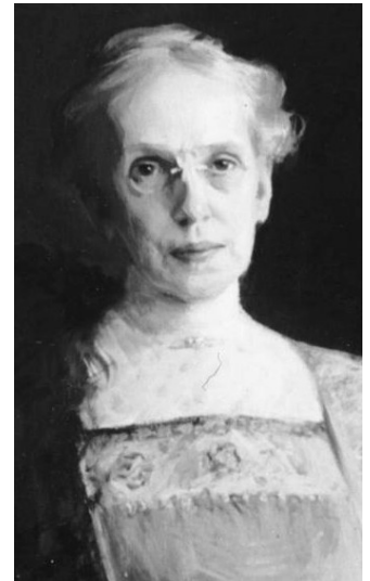
Ella Flagg Young

Membership by teachers in labor unions or in organizations of teachers affiliated with a trade union or federation or association of trade unions, as well as teachers' organizations which have officers, business agents, or other representatives who are not members of the teaching force, is inimical to proper discipline, prejudicial to the efficiency of the teaching force, and detrimental to the welfare of the public school system. Therefore, such membership, affiliation, or representation is hereby prohibited.